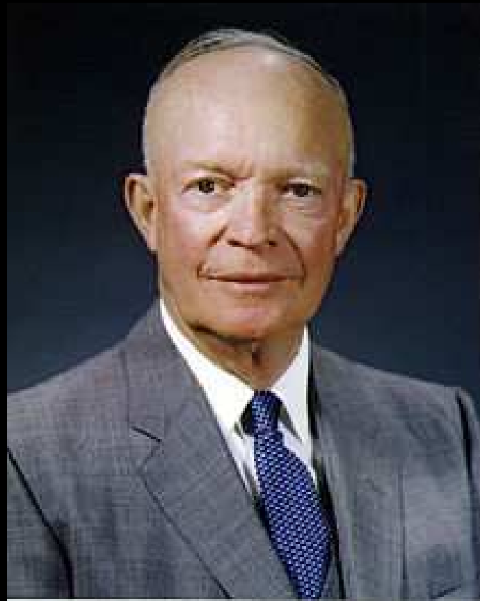
Dwight David 'Ike' Eisenhower 1890 - 1969