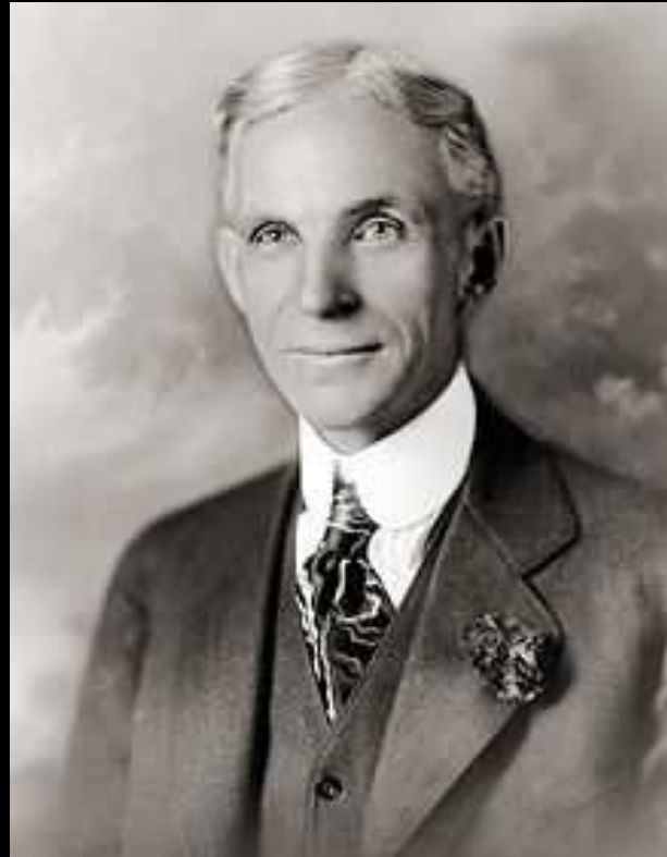
Henry Ford 1863 - 1947