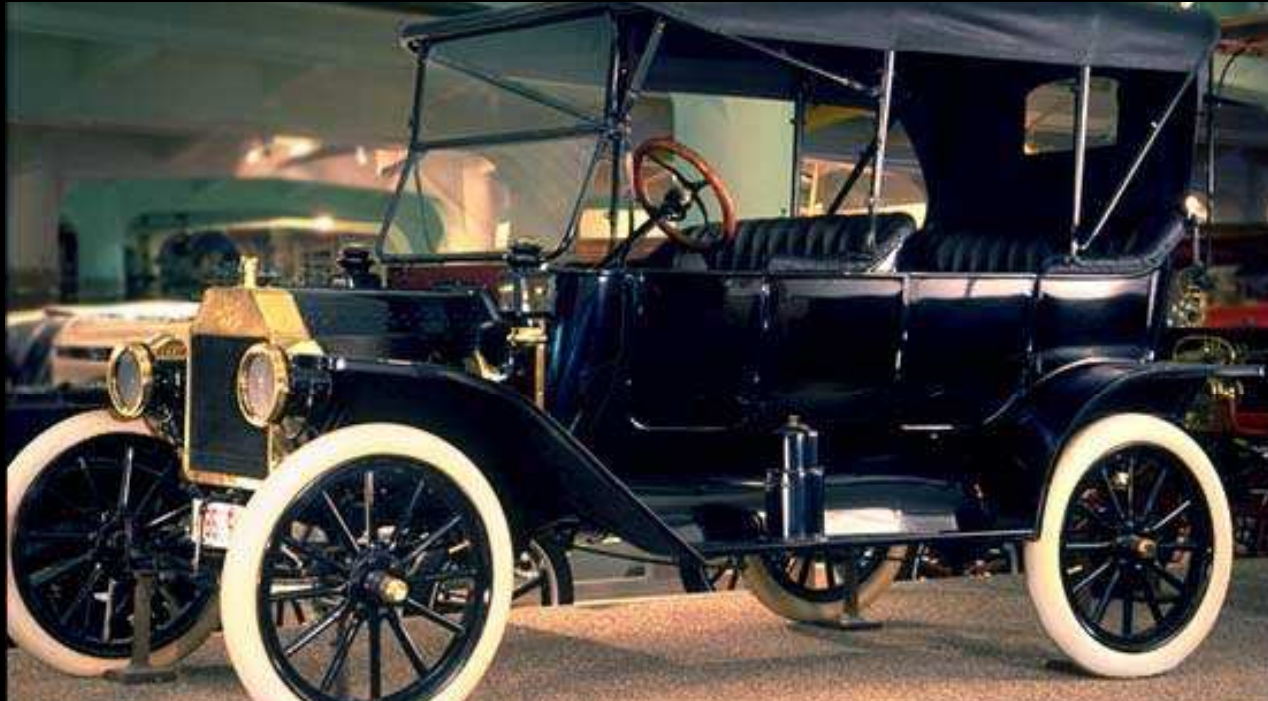
Model T by Ford Motor Company 1908